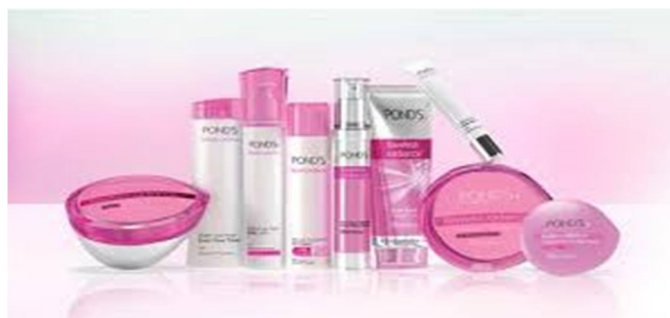
Fig 3: Resultant image of Fig 1's content and Fig 2's style.