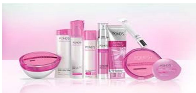
Fig 3: Resultant image of Fig 1's content and Fig 2's style.