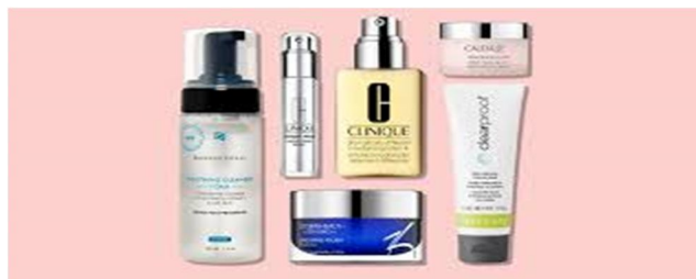
Fig 1: Content Image

Whenever something new is a cosmetic item, it becomes very difficult to choose. It is actually more than a challenge. Sometimes it's scary because new things I've never tried end up in a skin problem. We know that the information we need is behind each product, but it is really difficult to define those lists of ingredients unless you are a pharmacist. So instead of buying and trusting the best, why not use data science to help us predict which products might fit well? In this notebook, we will create a product-based recommendation system where the 'product' will be the chemical components of cosmetics.