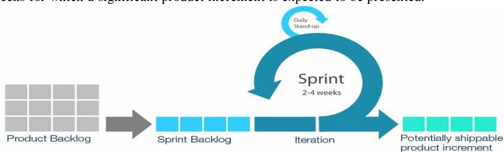
Figure 4 : Scrum Project

The whole idea behind Agile Project Management with Scrum is to give the end users exactly what they want. This can be achieved through “Sprints” or continuous feedback and iterations. Sprints are meant to be short, but regular, cycles of no more than four weeks for which a significant product increment is expected to be presented.