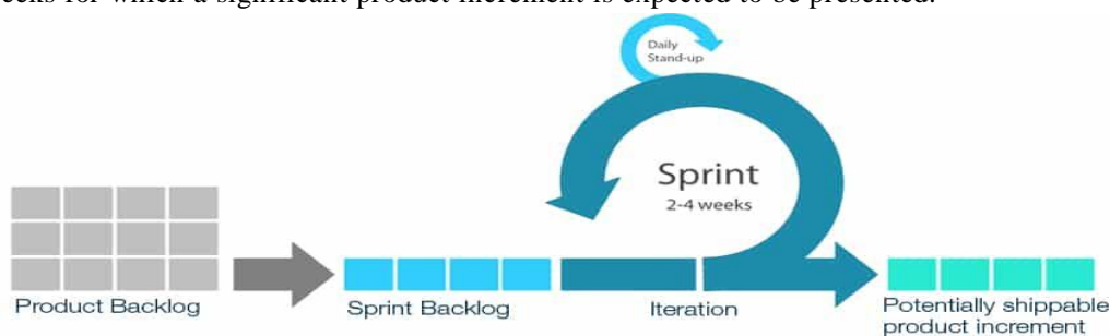
Figure 4 : Scrum Project

The whole idea behind Agile Project Management with Scrum is to give the end users exactly what they want. This can be achieved through “Sprints” or continuous feedback and iterations. Sprints are meant to be short, but regular, cycles of no more than four weeks for which a significant product increment is expected to be presented.