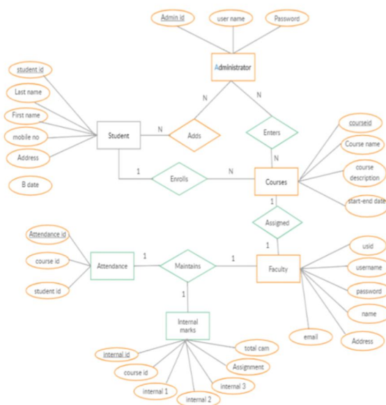
Fig 3.1 Flow chart

In Fig. 3.1 block diagram consists of complete college management system.