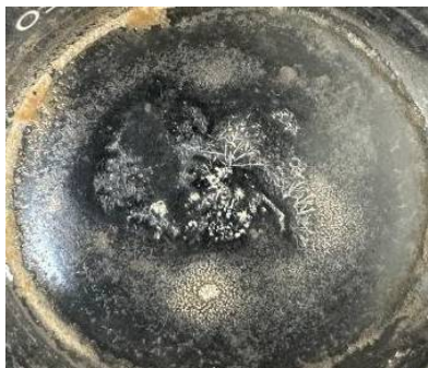
Figure.1 Extracted caffeine crystal

The above two pictures show the caffeine crystals. Figure 3.0 is the extracted caffeine from Tilo power cola. The extracted caffeine samples were introduced to the UV-Visible spectrophotometer to obtain the wavelength and the absorbance. A standard UV-Visible spectrum of caffeine is taken and compared with the obtained spectra. The standard spectrum of caffeine is given below: -