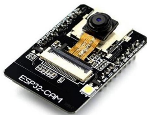
Fig. 2 ESP-32 Cam