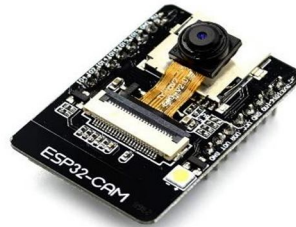
Fig. 2 ESP-32 Cam