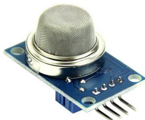
Fig. 1 Gas Sensor

It's cheap and Open effectively, and is ideally suited for IoT gadgets requiring a camera with cutting edge capabilities like Image Tracking and recognition. Gas sensors which are otherwise called gas detectors are electronic gadgets which distinguish and recognize various kinds of gasses. They are normally used to distinguish poisonous/ toxic or explosive gasses and furthermore used to measure gas concentration. Agricultural gas sensors are broadly used to screen and identify poisonous gasses tracked down food production and food quality control. Food and beverage makers and processors produce perilous or harmful gasses in many stages, including the processing of food, waste, and by-products and the preservation of food until it is opened.