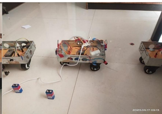
Figure 3. Live Image