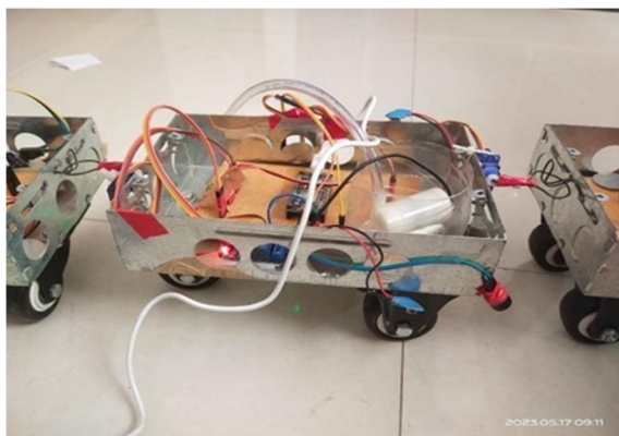
Figure 2. Bogy