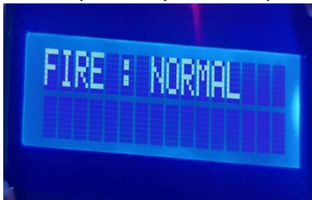
Fig. Fire Detection

The ESP32 Microcontroller's interface with all the all-sensor data are transmitted to the ESP32 microcontroller. The ESP32-based IoT-based smart fuel station was implemented, and the results were remarkable. The station's efficiency and user experience were improved by achieving real-time monitoring and control capabilities through the integration of sensors and actuators with the ESP32 microcontroller. The station's numerous components were able to communicate with each other more easily thanks to the ESP32, which made it possible to remotely monitor the fuel levels, equipment status, and weather. Furthermore, the Internet of Things' capabilities made it possible to gather and analyse data, giving station operators the ability to better manage fuel, anticipate maintenance requirements, and guarantee that environmental laws are followed. All things considered, the deployment showed how ESP32-based IoT solutions have the power to completely transform the way gas stations operate, providing enhanced sustainability, dependability, and customer convenience. This lowers the need for manual intervention, lowers the possibility of mistakes, and guarantees prompt service delivery. IoT connectivity also makes it possible to remotely monitor and