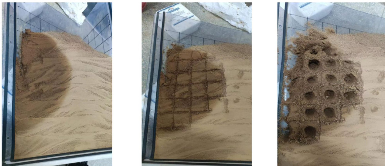
Fig2-2 Actual flow chart of sampling