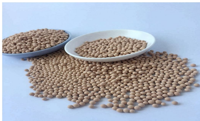
Fig.2 Zeolite 13X Pellets

13X zeolite is one of the microporous crystalline hydrophilic FAU and the sodium X zeolite type with large super cages and windows aperture pores of around 13 and 7.4 Å. Generally, the 13X zeolite is prepared by sodium aluminosilicate gels, using a wide range of silica and alumina sources via the hydrothermal synthesis route. Several researchers used 13X zeolite as adsorbent for CO 2 , N 2 , CH 4 , and H 2 separation, as binderless 13X zeolite beads for binderless CO 2 /CH 4 mixture separation, as CO 2 adsorbent in its modified state by amine-grafting, and as high-grade detergents due to its high magnesium ion exchange/removal capacity from water. (3)