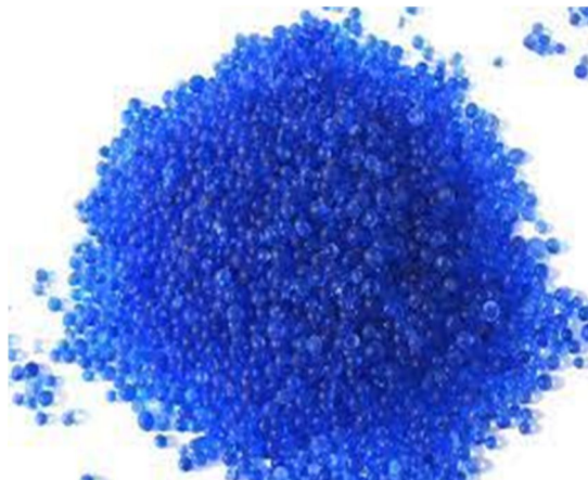
Fig.1 Silica Gel

Silica gel was known as early as 1640, but it remained a curiosity until its adsorbent properties were found useful in gas masks during World War I. It is generally prepared by acidification of a solution of a silicate; the resulting silicic acid forms either a rigid mass or a gelatinous precipitate. Soluble materials are removed from it by washing it with water. The water present is removed by heating, leaving a glassy, granular solid. For the highest activity as a desiccant, the gel is not made completely dehydrated, instead, it is left with a small percentage of combined water. (2)