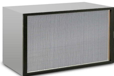
Fig.3 HEPA Filter

The HEPA filter is made up of borosilicate microfibers in the form of pleated sheets. The HEPA filter media is a glass and polymer blend and is pleated to provide more filter material in a smaller space. The sheet is pleated to increase the overall filtration surface area needed for the filtration. The pleats are separated by serrated Aluminium baffles or stitched fabric ribbons, which direct the airflow through the filter. This whole combination of pleated sheets and baffles acts as a filtration medium. It is installed into an outer frame made of fire-rated particleboard which is made up of Aluminium, or Stainless Steel. The frame-media junctions are permanently glued or pot-sealed to ensure a leak. (5)