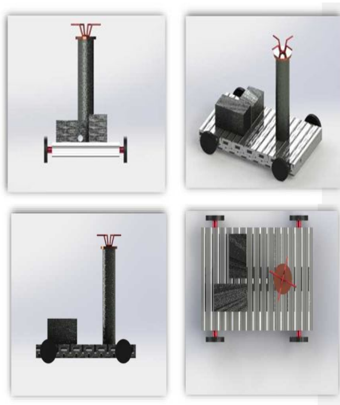
Fig.3. CAD Design of system