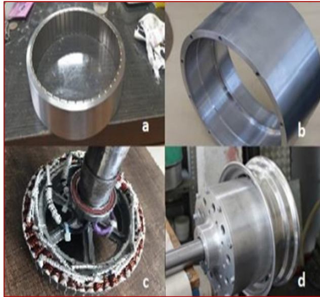
Fig. 1.1 Motor

This means for the same input power, a BLDC motor will convert more electrical power into mechanical power than a brushed motor, mostly due to absence of friction of brushes.