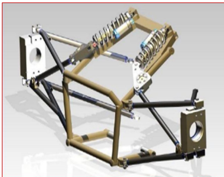
Fig.1.2. Rear Suspension Assembly

3) Suspension system : The suspension of F1 car has all of the same components of a road car. Those components include springs, dampers, arms and anti-sway bars. A suspension must be able to take high loads. When an F1 car goes over a kerb at high speeds, the suspension needs to be strong and stiff to be able to handle those loads without occurring any damage. The main purpose of suspension is to connect a car to its wheel. It does not need a complex system of different components because moving a heavy object like a car at high speed creates several challenges. The suspension makes sure the car can handle uneven surfaces; it dissipates the energy that is generated when travelling over undulations and ensures that the grip is spread correctly between the four tires.