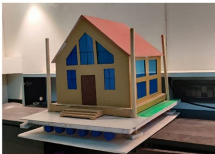
Figure 2. Project Prototype made by ( 1 Meghanjali Rao, 2 Akash Patil, 3 Mrunmai Gaikwad, 4 Ashwin Bagul)