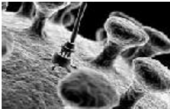
Fig. 1: Nanomaterial in the Environment [2]

The history of nanomaterials began immediately after the big bang when Nanostructures were formed in the early meteorites. Nature later evolved many other Nanostructures like seashells, skeletons etc. Nano scaled smoke particles were formed during the use of fire by early humans. The scientific story of nanomaterials however began much later. One of the first scientific report is the colloidal gold particles synthesized by Michael Faraday as early as 1857. Nanostructured catalysts have also been investigated for over 70 years. By the early 1940's, precipitated and fumed silica nano particles were being manufactured and sold in USA and Germany as substitutes for ultrafine carbon black for rubber reinforcements [4].