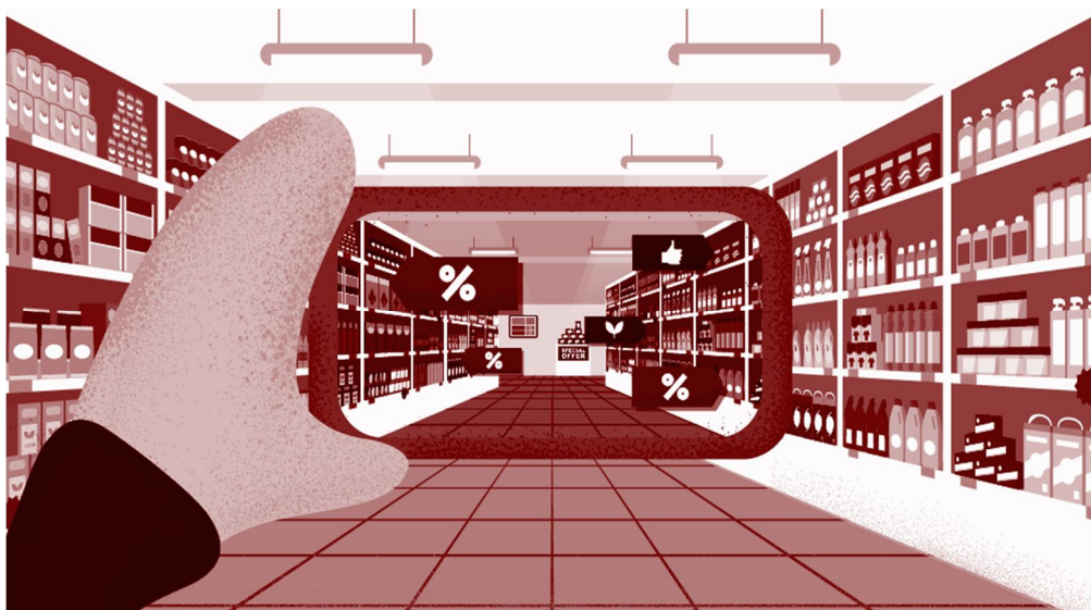
Fig 7.1: Representation of AR AND VR technology in E-Commerce