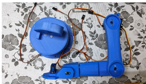
Fig 2. 3d printed parts

A layered additive manufacturing approach is used in the construction of robotic arm parts using 3D printing, enabling the production of complex and customised parts. The robotic arm is first divided into layers in a digital model that is often created with computer-aided design (CAD) software.