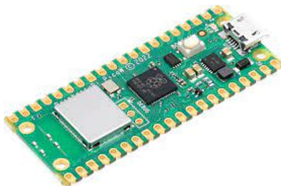
Fig 6. Raspberry Pi Pico

The Raspberry Pi foundation ( raspberrypi.org ) has changed the world by providing powerful, low-cost computer boards. The Raspberry Pi is by far the biggest selling and most popular of the many small computer boards available. Perhaps even more important is the Raspberry Pi designed for education. Educators can use the Raspberry Pi to teach computer science, electronics, hardware automation, and Internet of Things (IoT) projects using Python, Java, or C++ programming languages.[7]