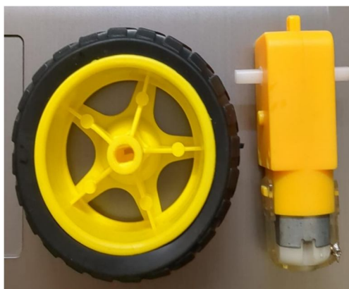
Fig 4. DC motors and Wheels

DC brush motors offer a reliable and controllable option for powering robotic applications, finding use in tasks like locomotion, manipulation, and actuation. Their advantages include simple controllability with pulse-width modulation (PWM), high torque at low speeds, and efficient battery power usage. However, factors like limited speed range, brush wear requiring maintenance, and cogging torque can be drawbacks.[5]