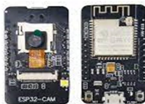
Fig 3. ESP32-CAM

ESP 32 microcontroller with a built-in camera for image classification tasks using a convolutional neural network. ESP32 is commonly used in IoT devices to read data and control sensors, so its computing power is not significant, which has a positive effect on the cost of the device. The prevalence of ultra-low-power embedded devices such as ESP32 will allow the widespread use of artificial intelligence-built-in IoT devices. The duration of photographing and photo processing is obtained in the paper, as this can be a bottleneck of the microcontroller, especially together with machine learning algorithms. Deployed a convolutional neural network, pre-trained on another device, using the MobileNet architecture on a microcontroller, and proved that the ESP32 capacity is sufficient for simultaneous operation of both the camera and the convolutional neural network.[4]