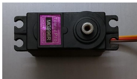
Fig 5. MG996R motors

The MG996R servo motor is a popular choice for hobby robots and small-scale robotics projects due to its affordability, reliability, and decent performance. With 9.4 kg/cm of stall torque and 0.17s/60° speed (at 4.8V), it offers moderate power and responsiveness for tasks like manipulating lightweight objects or positioning sensors. However, its 180° rotation limit and limitations in continuous operation necessitate careful consideration for applications requiring more demanding movement profiles.[6]