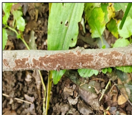
Figure 1 peniophora albobobdia