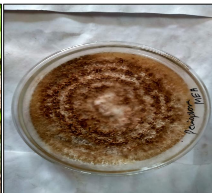
Figure 2 culture on MEA Plate

The fungal sample collected from dead logs subjected to the morphological identification. Based on the morphological and microscopic characters, it is inferred that the isolated fungus belongs to the class of basidiomycetes white rot fungus Peniophora Cooke (Peniophoraceae, Russulales) is a large corticioid genus characterized by annual Basidiomes, adnate resupinate with a smooth hymenophore, a dimitic hyphal system with both encrusted cystidia and gloeocystidia, and thin-walled smooth basidiospores. Species of the genus prefer to grow on small branches especially those dead but still attached.