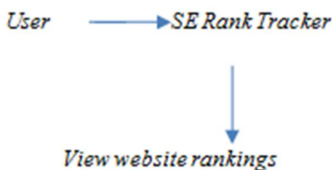
Figure 1. Working Analysis