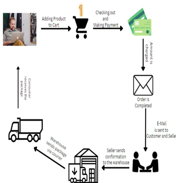
Fig. 1. Life Cycle of order placed in E-Commerce

The request is sent to the merchant’s web server and received by the merchant. Both the client browser and merchant’s server are linked to the payment server where customer and merchant are verified, order information and payment information are reviewed, the order is confirmed or payment is denied. These payment servers are third party computers which uses multiple payment systems like Credit card (VISA or Master card), Bank Accounts (Debit Card or Online Banking), E-bill payments (UPI, PAYTM) etc. once the order is verified, the details are sent to the customer, merchant are warehouse and the shipping is done. The customer receives the product and request is closed.