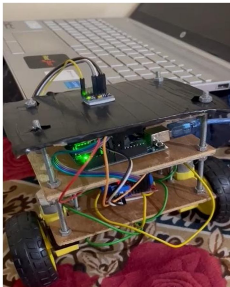
Fig no: 02 Self Balancing Bot

Balancing performance is a crucial aspect of the project because it indicates how effectively the PID control system, sensors, and motors work together to keep the rover upright. The project's primary objective is to achieve self-balancing. The rover balances itself by moving its wheels in a frontal direction when its body tilts forward, which causes the rover's body to move backward and achieve balance.