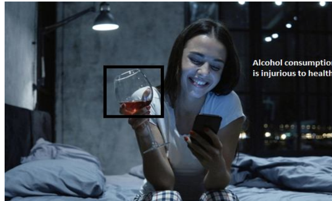
Fig2: Our model detected and showed message

To make this system work, the first thing we require is a vast amount of data. To gather the dataset we aim to use various scenes from movies, cctvs, google depicting scenes where any person is consuming alcohol . Now after getting the dataset we are going to use YOLO(You Only Look Once), a popular object detection model.