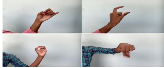
Fig.no. VI.1 Different Alphabet Signs