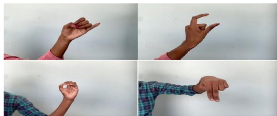
Fig.no. VI.1 Different Alphabet Signs