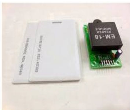
Fig -2: RFID card and card reader