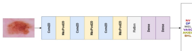
Fig 2:CNN for skin cancer classification