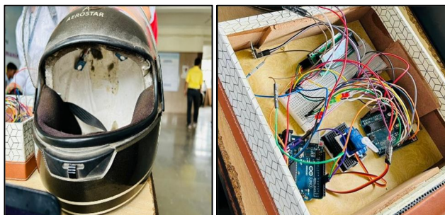
Figure3: final System.

The successful integration of a Smart Helmet, touch sensor technology, and sophisticated sensors such as tilt sensors and gyroscopes within the vehicle has proven to be a groundbreaking advancement in the realm of road safety. The touch sensor's seamless communication with the Arduino microcontroller, facilitated by an RF transmitter and receiver, exemplifies a user-friendly and efficient method for initiating vehicle activation. Moreover, the tilt sensor and gyroscope contribute to a robust real-time monitoring system, continuously providing essential data on the vehicle's orientation.