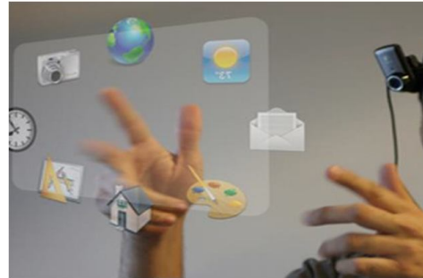
Fig. 3 Application of six sense technology