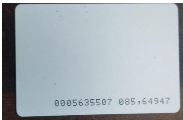
Fig. 4.3 RFID Tag

The illustration of 'Welcome GNITS' is shown in Fig. 4.4. The message is displayed on LCD as an interactive message.