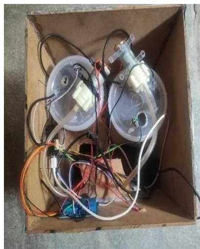
Fig. 4.2 Internal Circuit of SCVM

The Fig 4.2 depicts the internal circuit. In the internal circuit, connections are arranged in order to obtain the desired output. Fig 4.3 show a valid RFID tag used by the user to get the access. Fig 4.4 LCD Displaying 'Welcome GNITS'.