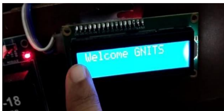
Fig. 4.4 LCD Displaying 'Welcome GNITS'

The illustration of 'Welcome GNITS' is shown in Fig. 4.4. The message is displayed on LCD as an interactive message.