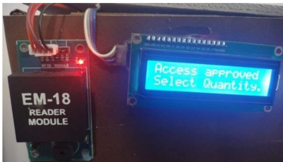
Fig. 4.5 Authentication for Access Approval

The Fig 4.5 illustrates that the authentication process is successfully completed. Thus, displaying a message on the LCD as 'access approved Select Quantity'. As soon as the user observes the message on the display, he selects his choices & gets a cup of his choice.