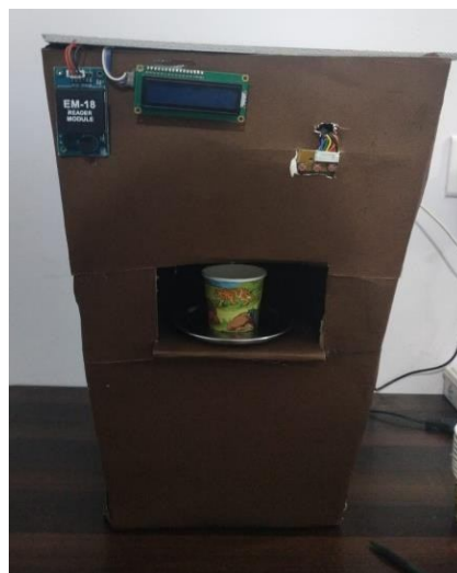
Fig. 4.1 SCVM

The Fig 4.1 shows the overall structure of the coffee vending machine in which the entire circuit and the components are assembled neatly.