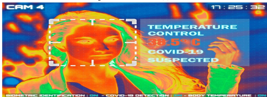
Fig. Thermal database (1)

IR images are acquired using thermal cameras that estimate the temperature of a body and generate an image through a process called thermograph [23], [24]. The energy collected by thermal sensors is a sum of several energy components related to the different elements present in the scene captured by the camera. A scene can be divided into three elements: the object to be measured, the background and the atomsphere.