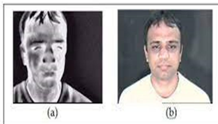
Fig. Thermal scanning image using body temp

Variations in one of these components may affect the temperature estimation performed by the IR camera and consequently affect facial recognition. Thereby, the main challenges of the use of thermal face images for face recognition include: undesirable variations produced by the changes of environment temperature and weather—known as extrinsic factors—and intrinsic factors such as variable sensor response when the IR camera is working for long periods of time, and physiological changes in the metabolic processes of the subjects (e.g. disease). Both extrinsic and intrinsic factors generate temporal variations in the face images affecting the thermal face recognition performance—which is also known as the time-lapse problem. For both databases, all the images were acquired in a controlled environment, between 23°C and 24°C, allowing the minimization of the effects of the background or any atmospheric factors that may lead to thermal variations in the thermal face images.