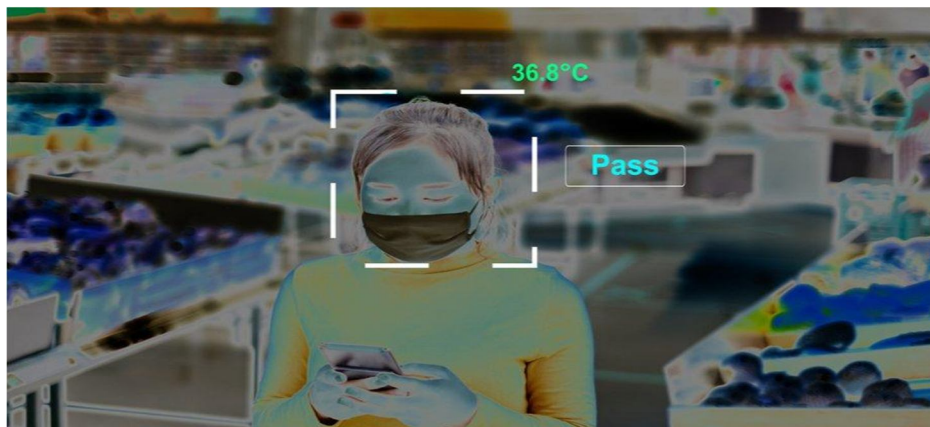
Fig. Thermal Database (2)

Variations in one of these components may affect the temperature estimation performed by the IR camera and consequently affect facial recognition. Thereby, the main challenges of the use of thermal face images for face recognition include: undesirable variations produced by the changes of environment temperature and weather—known as extrinsic factors—and intrinsic factors such as variable sensor response when the IR camera is working for long periods of time, and physiological changes in the metabolic processes of the subjects (e.g. disease). Both extrinsic and intrinsic factors generate temporal variations in the face images affecting the thermal face recognition performance—which is also known as the time-lapse problem. For both databases, all the images were acquired in a controlled environment, between 23°C and 24°C, allowing the minimization of the effects of the background or any atmospheric factors that may lead to thermal variations in the thermal face images.