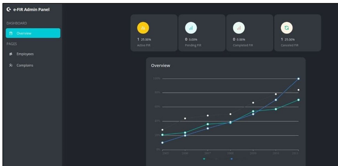
Figure 3: Admin Panel of Proposed System