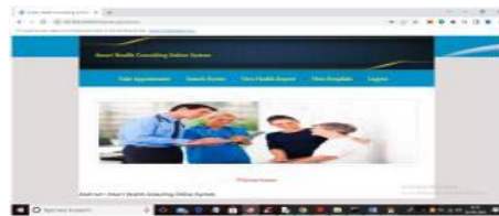
Fig. 5: Patient Login

Fig-4 displays the access given to the admin in which the admin can add the details of the doctors and the diseases.