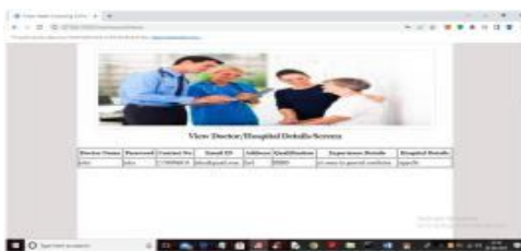
Fig. 6: Hospital Details

Fig-5 displays the access the given to the patient in which patient can contact the required doctor and send the relavent reports.