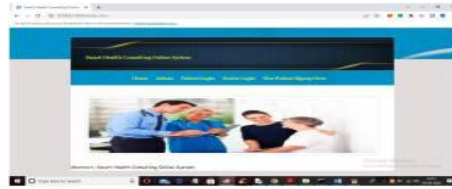
Fig. 3: HOME PAGE

Fig-3 displays the logins required for the user to access our website which includes the admin , doctor , patient login buttons.