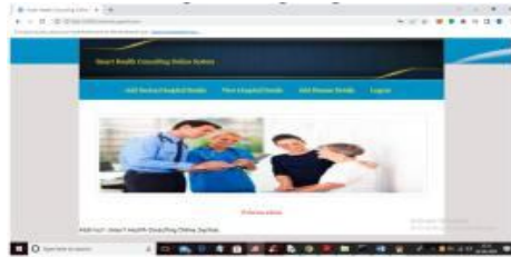
Fig. 4: Admin Login

Fig-3 displays the logins required for the user to access our website which includes the admin , doctor , patient login buttons.