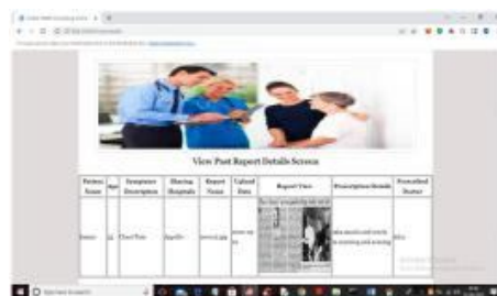
Fig. 7: Prescription

Fig-6 displays tne hospitals that are associated with our project which are available to the patient for consultation.