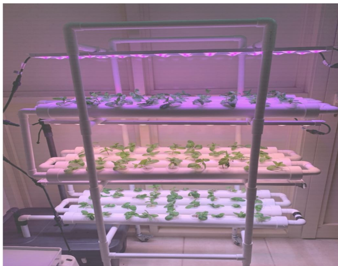
Fig. 2 Muhammad E. H. Chowdhury, Amith Khandakar, Saba Ahmed, et al. Sensors 2020, 20(19), 5637; https://doi.org/10.3390/s20195637

There were several vertical hydroponic systems available, including the A-frame, Zig-zag, vertical hydroponic tower, ZipGrow tower, and vertical Nutrient Film Technique (NFT) system. The idea and design of the vertical NFT system which I have chosen for this study are among the several vertical hydroponic systems that are currently available. It is because of the straightforward design, ease of assembly, simple configuration, high plant production in a short space, and strong supporting system that holds the whole structure.