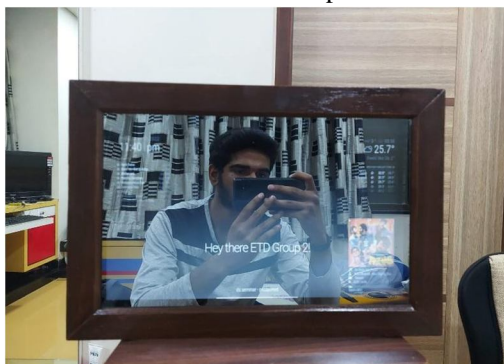
Fig 2 – Mirror (1)

The result of this project is a fully functioning Smart Mirror which has features which are needed in our day-to-day life. The output is first seen on the laptop screen after we boot up the OS in Virtual Box. The output which is seen on the laptop screen is then given to the monitor which is there behind the mirror with a HDMI cable. The pictures attached below show the mirror in action.