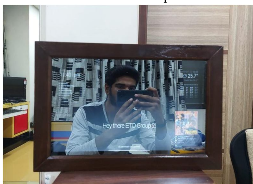
Fig 2 – Mirror (1)

The result of this project is a fully functioning Smart Mirror which has features which are needed in our day-to-day life. The output is first seen on the laptop screen after we boot up the OS in Virtual Box. The output which is seen on the laptop screen is then given to the monitor which is there behind the mirror with a HDMI cable. The pictures attached below show the mirror in action.