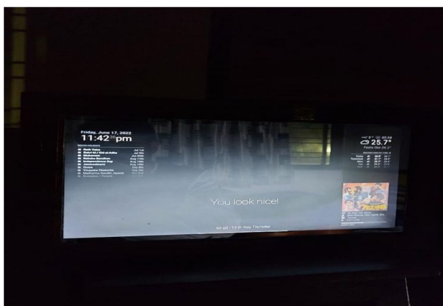
Fig 3 – Mirror (2)