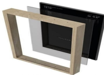
Figure 1: components of smart mirror display

With its rapid growth, the internet of things has transformed people's environments by transforming their homes into smart homes. A smart house is one that is connected to smart devices and communicates with them over the internet. Our style of life has progressed to the point where the most important thing is to save time. Because of the rapid advancement of technology, the use of smart gadgets is growing every day. Every day, we examine ourselves in the mirror to assess our appearance and outfit. We are psychologically connecting with the mirror in this way. So, everyone can be excited by the prospect of a mirror that can answer to any of your commands. The normal mirror is transformed into an arrogant mirror, which is then employed as an information system to collect data. On a single user interface, several tasks can be completed. In a matter of seconds, the smart mirror device may check regular activities, critical meetings, and worksheets on a pc, tab, cell phone, or other device. The smart mirror is an internet of things (iot)-based intelligent technology that can be used to facilitate and improve the user's awareness of numerous functions. With the help of interactive computing systems and embedded systems, the level of living and quality is changing dramatically by using this smart mirror. A smart mirror can be utilized as a commonplace item to alter a person's perception of themselves in the mirror