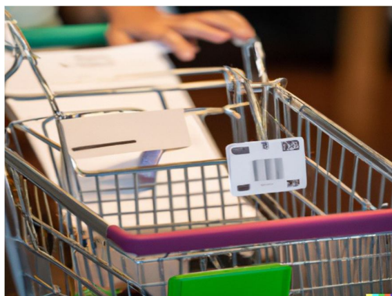
Fig.1. FRID Smart Cart