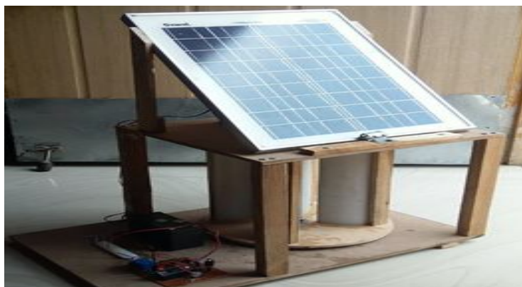
Figure 2: Model of Proposed hybrid solar-wind system