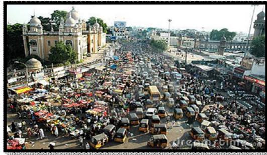
Figure 1 Traffic jams on Roads

One of the most important problems in India is Traffic. Most countries have automobiles, buses, trucks, motor vehicles, motors, scooters and bicycles. However, in India, additionally to the current routine urban transportation, and contributing substantially to the congestion, are networks of auto-rickshaw, two wheelers still as heavy vehicles. This has led to the explosion of traffic, higher number of accidents, deaths and increase in commuting time over the years.