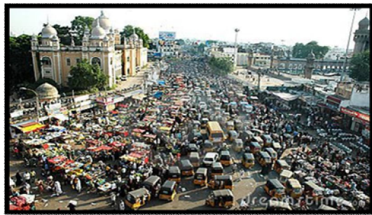
Figure 1 Traffic jams on Roads

One of the most important problems in India is Traffic. Most countries have automobiles, buses, trucks, motor vehicles, motors, scooters and bicycles. However, in India, additionally to the current routine urban transportation, and contributing substantially to the congestion, are networks of auto-rickshaw, two wheelers still as heavy vehicles. This has led to the explosion of traffic, higher number of accidents, deaths and increase in commuting time over the years.