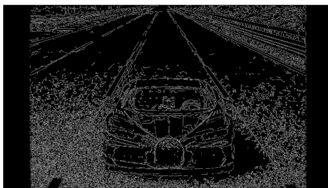
d) After performing Canny Edge detection technique