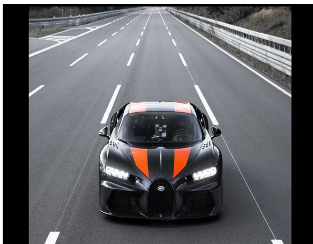
a) Original Image