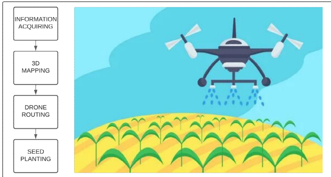
Fig. 2 Drone Seeding Illustration and Process Mapping

Planting a seed in the farm, as stated in the problem description, is another time-consuming task. As a result, drone seeding is required to carry out the action. Our recommended strategy for the drone seeding module is that the drone carries several types of seed, and our farmer may arrange a pre-planned route based on the input from soil sampling using 3D mapping. As a result, the seed will germinate in the proper location. Figures 2 depict the process mapping and image illustration of drone seeding, respectively.