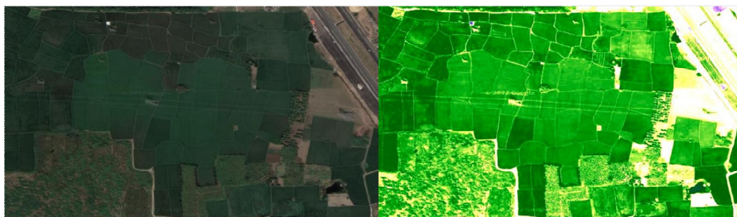
Fig. 3 Real Colour Image and NDVI Image

In other words, the higher the NDVI, the better the plant's health. Low NDVI indicates a lack of vegetation. The comparison between the Real Colour Image and the NDVI Image is shown in Figure 3.