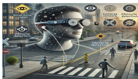
Figure 1: The Blind's smart sight Concept: