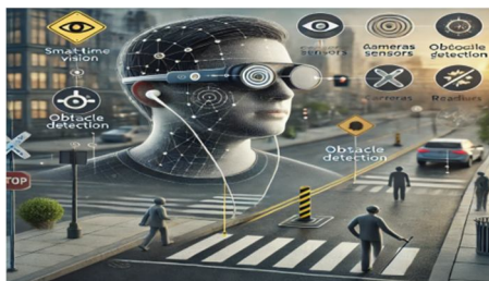
Figure 1: The Blind's smart sight Concept: