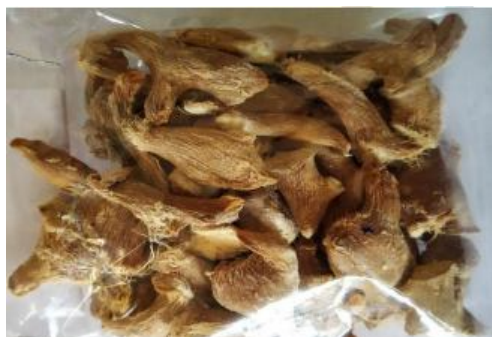
Fig 3: After drying

After the result the basic calculations will be calculated with the moisture content with initial and final moisture content.