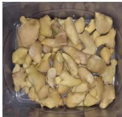
Fig 2: Before drying

The results obtained from the solar dryer is following conditions with assumed the result was calculated with minimum six hours per day drying with 1 kg ginger. The various air flow rate the hot air flow rate was changed and the result will plotted with graphs. The values are taken with every one hour and the moisture content will find with every one hour. So the values are tabulated with variation of solar intensity.