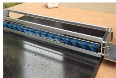
The Selected Brush Design Installed on Prototype

The options for methods of cleaning were mostly different options of moving the cleaning material. The criteria for the cleaning method were the same as the criteria for the cleaning material. The options considered were an axle that lies across the panel and spins, a disk that moves side to side like a buffing machine, a lock that applies constant pressure across the panel and drags the cleaning material across it similar to a sweeping broom, and a drip system that leaks cleaning solution down the sides of the panel. A spinning axle that lies across the panel was chosen because of its proven effectiveness in operations like a car wash.