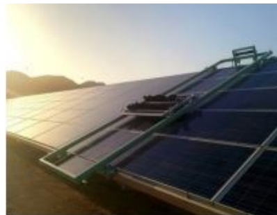
Solar Cleaning System

Solar cleaning robot uses a slightly different technique to clean the solar panel. In this system, a guiding railing is attached over the solar panels as shown in Figure 3. The guiding railing frame work can move horizontally over the surface of the array of panel. For top to down movement, the robot moves on the railing frame work. By sweeping its microfiber brushes connected to the head, Ecopia solar panel cleaning project cleans the surface of the solar array. The system has its own battery which is charged through its own solar cell. This energy storage features allows the system to clean the panels in the night. Furthermore, the system can also be controlled through internet.