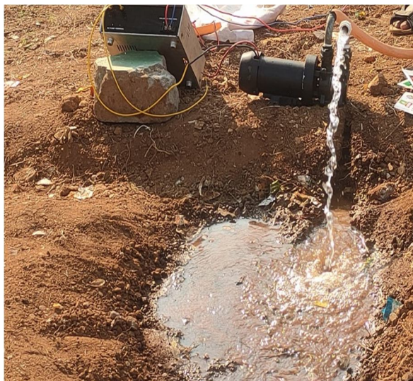
Fig 3: pump and converter in project

Three-stage squirrel-confine enlistment engines are broadly utilized as modern drives since they are self-beginning, dependable, and affordable. Single-stage acceptance engines are utilized broadly for more modest burdens, for example, home devices like fans. Albeit generally utilized in fixed-speed administration, acceptance engines are progressively being utilized with variable-recurrence drives (VFD) in factor speed administration. VFDs offer particularly significant energy investment funds open doors for existing and forthcoming acceptance engines in factor force radial fan, siphon, and blower load applications. Squirrel-confine acceptance engines are broadly utilized in both fixed-speed and variable-recurrence drive applications.