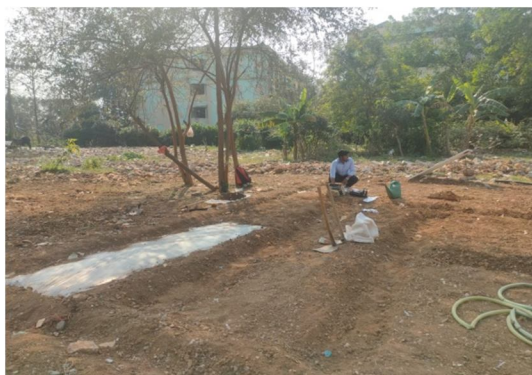
Fig 5: Site selection at GIFT