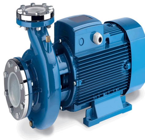
Fig 4: Induction motor