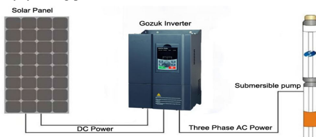
Fig 2: Internal working of a solar based irrigation system

The Sun-based siphoning framework is a series-equal ingest daylight radiation energy through sunlight-based chargers and convert it into AC power by an inverter to drive diffusive siphon, water system siphon, pivotal stream siphon, blended stream siphon of profound well water siphon framework. As per the difference in the force of daylight, sun-oriented siphon inverter framework changes yield recurrence progressively, yielding power near the sun cell cluster most extreme power.