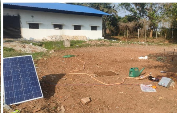
Fig 6: Project setup at GIFT