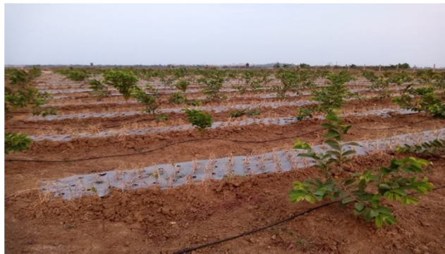
Fig 4: The mulching technique