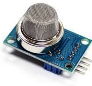
Fig.5 Smoke Sensor