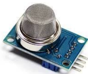
Fig.5 Smoke Sensor