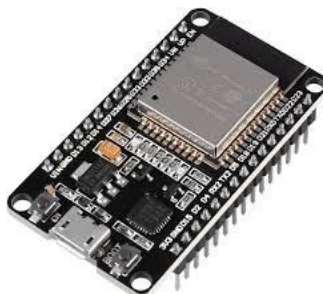
Fig.1 Node MCU

Node MCU-32S: The NodeMCU-32S can be used for various IoT applications and projects including home automation, environmental monitoring, data logging and remote control systems. The possibilities are endless, limited only by the developer's imagination. This abridged version provides a brief overview of the NodeMCU-32S, its features, hardware, programming options and applications.