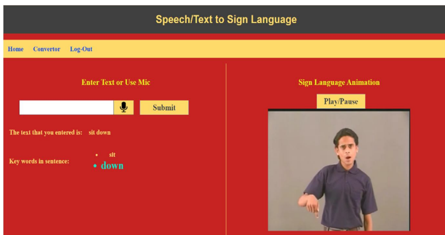
Fig. 4.2 Example of animated output