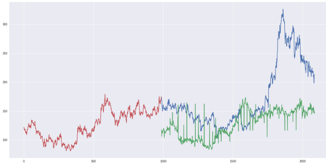
Fig.4: KNN Implementation