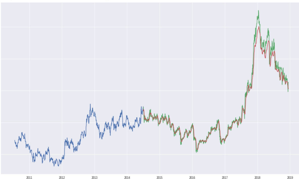
Fig.5: LSTM Implementation