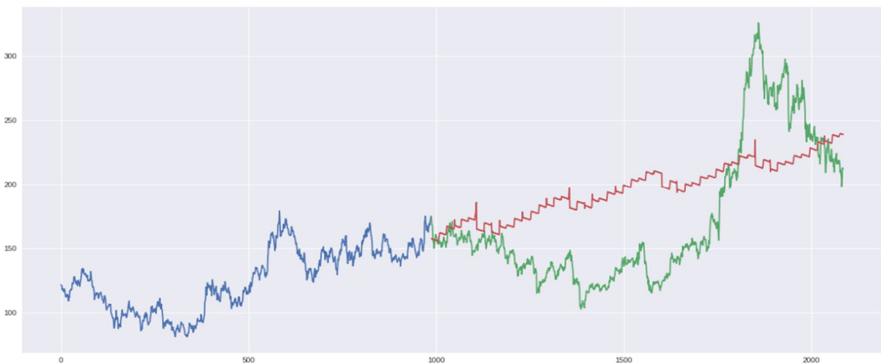
Fig.3: Linear Regression