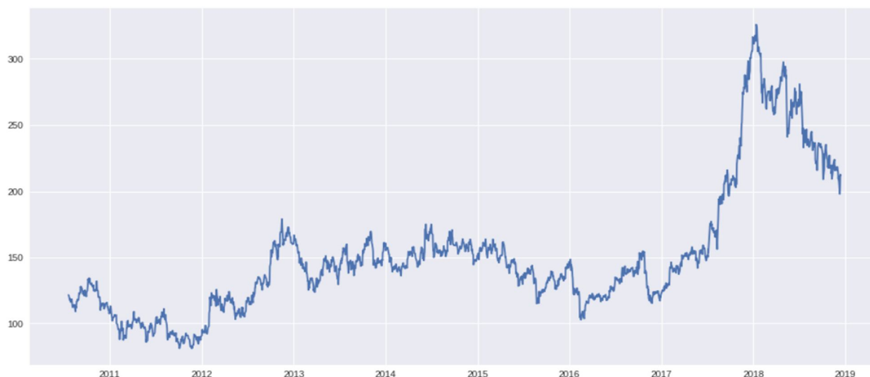
Fig.2: Stock close price chart