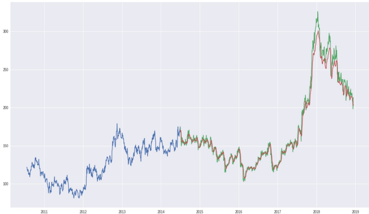
Fig.5: LSTM Implementation