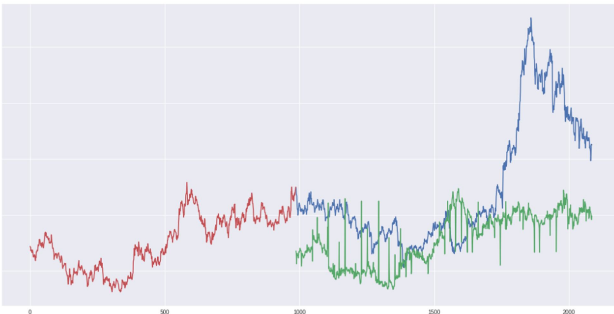
Fig.4: KNN Implementation