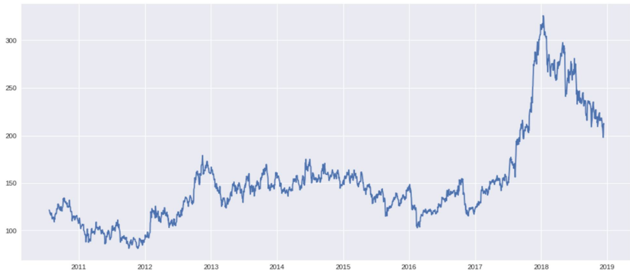
Fig.2: Stock close price chart