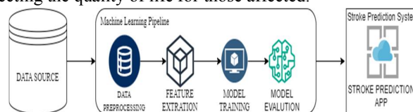
Fig (I): System Overview

Stroke represents a debilitating and potentially life-threatening medical condition, presenting a significant global health challenge. According to the World Health Organization (WHO), strokes account for approximately 11% of all global deaths, ranking as the second leading cause of mortality. Furthermore, strokes often result in severe disabilities, imposing a considerable burden on healthcare systems and adversely affecting the quality of life for those affected.