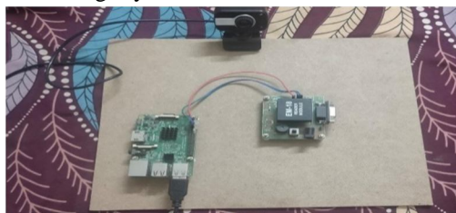
Fig:Experimental kit setup

The most difficult and successful aspect of the system, though, is the integration of Face Recognition. It guarantees that the system will correctly identify the authorised person. We can argue that the system is a virtually perfect identification and counting system because face recognition is validated by another RFID-developed technology. However, we also intend to connect the two systems so that they can work together and to include a storage system, which will enable us to keep all the data.