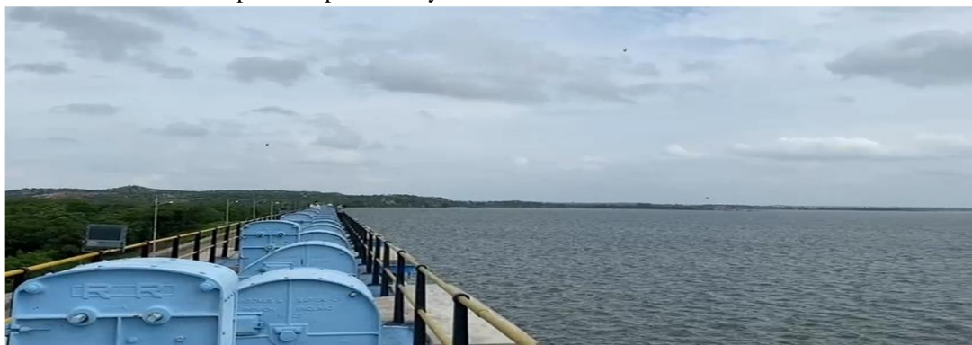
Himayat Sagar Lake

Himayat Sagar Lake is an artificial lake about 20 kilometres (12 mi) from Hyderabad in the Ranga Reddy district of Telangana, India., is an important source of drinking water for the surrounding population. Unfortunately, this vital resource is facing increasing pollution day by day, caused by a variety of sources, including industrial and agricultural runoff, sewage, and garbage. It is crucial to continuously monitor and assess the parameters of water quality in Himayat Sagar. This monitoring should include testing for contaminants such as heavy metals, pesticides, and also other pollutants. Additionally, the lake is also a popular spot for picnics and recreation and plays an important role in saving the city from floods. Therefore, protecting the quality of water in Himayat Sagar is not only important for human consumption but also it is equally important for maintaining the ecological balance and preserving the natural services and products provided by the lake.