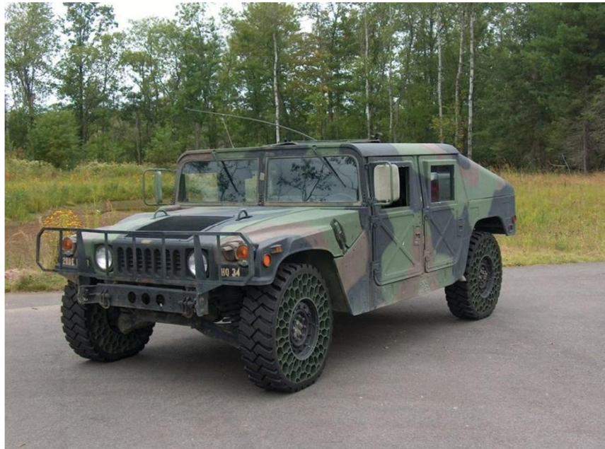
Fig 4: Military vehicle with NPT

American military automobiles such as Hummer, trucks, etc., are non-pneumatic tires. The primary benefit of the military automobiles utilizing this tire is that it needs extremely small or no supervision. It will stay portable even with some spokes impaired or missing. In addition, it passed the ballistic trial, i.e., it will remain portable even if it is pounded by ammunition, which is a benefit on the battleground.