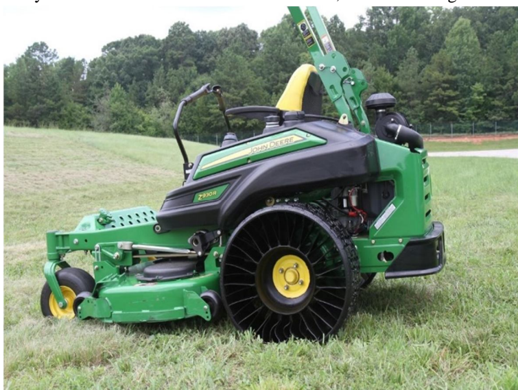
Fig 2: Earthmover

The non-pneumatic tires provide increased stability to the earth movers to rise in all terrains. It provides a much smoother passage than a pneumatic tire due to its superior shock absorption. Even if the automobile is heavy, it will not harm the running surface. In expansion, the NPT is exceptionally immune to dents than the standard tires, which last longer.