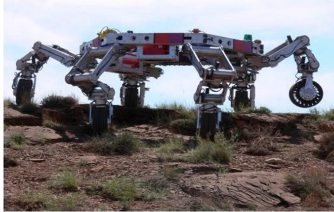
Fig 3: NASA lunar rover

It is a six-legged robot developed by NASA for moon exploration. All the wheels contain NPT. It can roll or walk over an extensive range of terrains and was designed to tackle various techniques. It is impossible to utilize pneumatic tires in the stretch because of vacuum; these airless tires have the upper hand in space exploration.