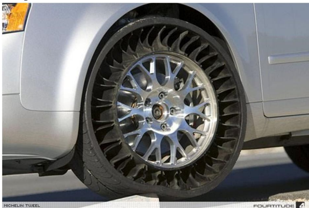
Fig 1: Tweel

When the Tweel is put to the route, the spokes immerse road affects the identical way air coercion does in pneumatic tires. The track and shear bands are temporarily distorted due to bending of the spokes, then quickly spring brings back into shape again. Tweels can be made with additional spoke tensions, qualifying for other operating features. More pliant spokes result in a better relaxing ride with enhanced handling. The sideways immobility of the Tweel is also flexible. However, you can't modify a Tweel once it has been fabricated. Instead, you'll have to choose a separate Tweel. For testing, Michelin provided an Audi A4 with Tweels created with five times as considerably lateral stiffness as a pneumatic tire, resulting in "extremely responsive handling." Michelin reports that "The Tweel prototype is within 5 percent of the rolling oppose and the mass levels of normal pneumatic tires that decode to mean within 1 percent of the fuel thrift" of the tires on your automobile. Nevertheless, Michelin could enhance those numbers since the Tweel is exceptionally earlier in its expansion.