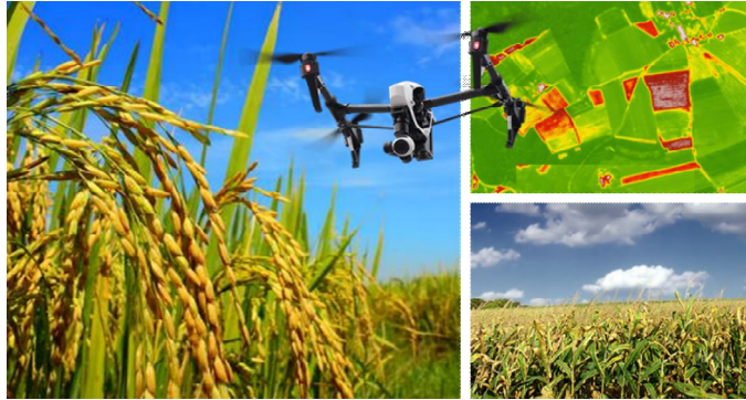
Fig.2 Pictorial representation [5]

2) AI Drones to Monitor Crop Growth: Agriculture is a large-scale activity in which it requires lot of man power and time to analyse the whole field. It is not an impossible job but still there could be lots of errors. AI based Drones can also do the same job in a few hours and perfectly. It is important to evaluate crop fitness and see bacterial or fungal infections on trees. These statistics can produce multispectral photos that adjusts in vegetation and imply their fitness. In addition, as quickly as an illness is discovered, farmers can follow and reveal treatments extra precisely. These opportunities boom a plant's cap potential to catch a disease. Infrared mapping allows drones to collect information about the health of both soil and crops. [5][3]