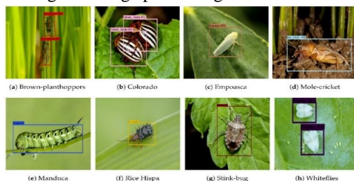
Fig.1 Sample picture [8]

The AI system uses satellite images and algorithms to compare it with the data like what all insects has landed on the crops such as locusts, grasshoppers, caterpillars etc. After the detection of insects needed precautions should be carried out by applying the pest control which helps the farmers to fight pests. Prognosis of crop pests and diseases can also be an advanced knowledge of imaging technology. This can be done using deep learning and image processing.