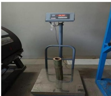
Fig no.14 Weighing Balance