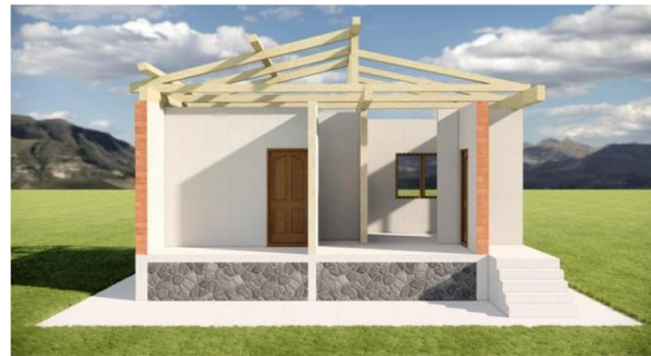
Fig no.10 Section of the Model