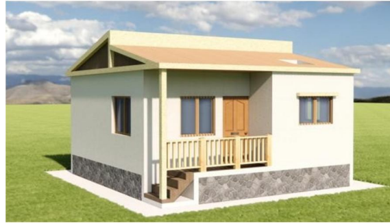
Fig no .9 3D Model