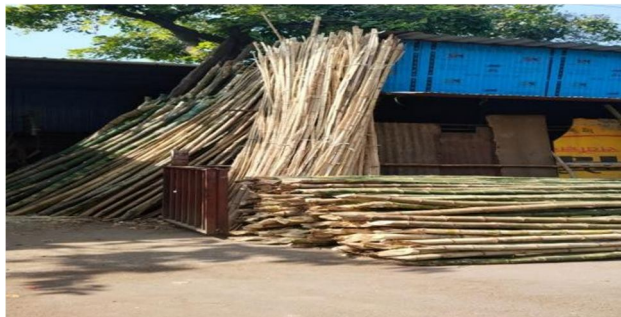
Fig no.3 Bamboo Used for Scaffolding