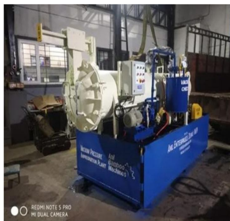
Fig no .7 Steaming Machine