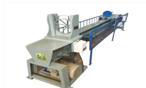
Fig no. 6 Bamboo Strips & Stripping Machine