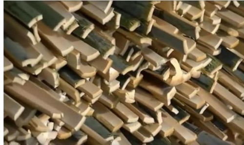
Fig no 5 Bamboo strips