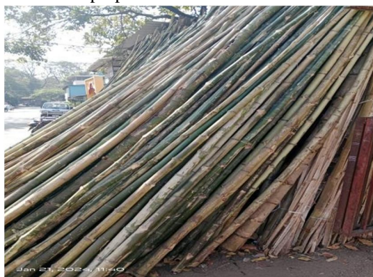
Fig no 1.Raw Bamboo

Timbre production and demands of peoples every year in timbre market Timbre market revenuegenerate around 10cr/year and huge marketing of the Bamboo ,every year around 200 - 400 tones sold by the Bamboo market Kolhapur, which helps the economy of the Kolhapur which improve the social, economical and also environmental condition of the Kolhapur district. By this survey we conclude there are 50 to 60 % sellers and merchants are sold timbre which is teak wood , and remaining are sellers sells bamboo 20 to 30 % for the construction purposesuch as for the shuttering, timbering and scaffolding.And remaining for the furniture works 10 to 20 % used for the household purpose .