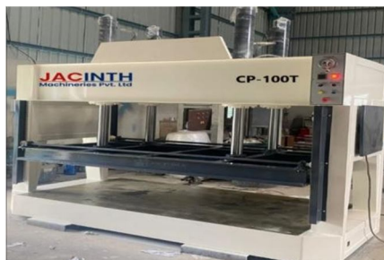
Fig no .8 Hot Press Machine