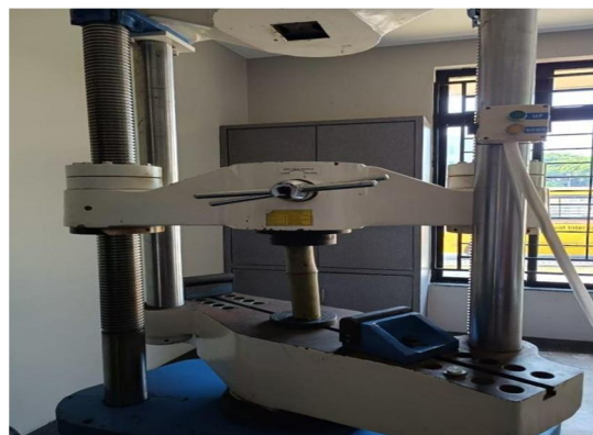
Fig no.12 Universal Testing machine