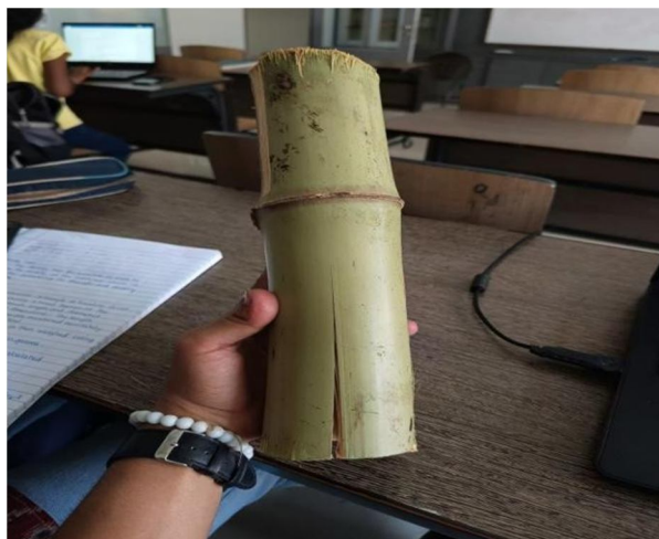
Fig no.13 Testing Specimen

2) Density of bamboo -The density test for bamboo is used to determine the density of the material which is important for the assessing its strength and quality